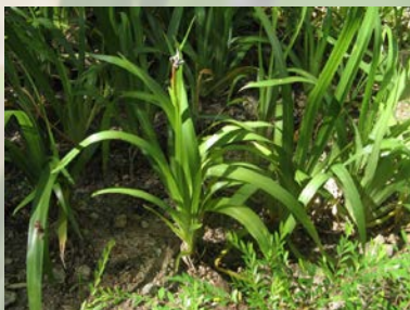
植物全身 whole plants