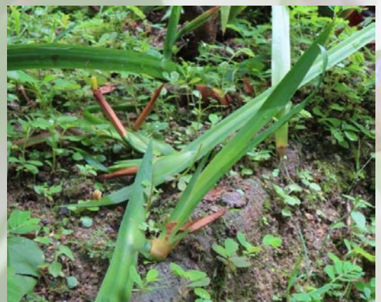
新株 new plant individuals