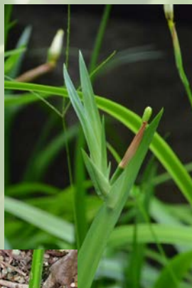
幼苗 new plantlets